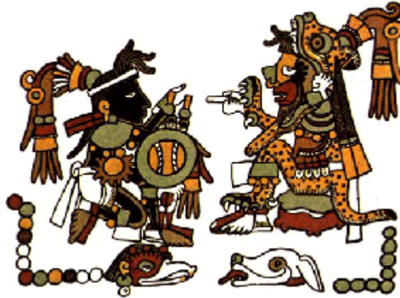
8-Deer, Mixtec Leader